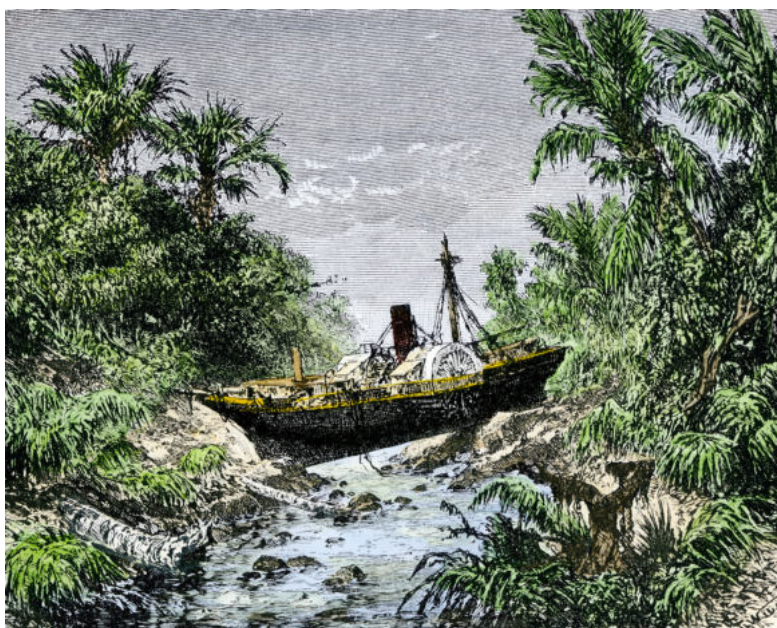
Figure 3. The SS Berouw after the tsunami.

It went on, and suddenly they saw – thanks to the red glow of light, that the volcano spread – that they were no longer carried across the ocean, but across the flooded and completely destroyed city of Anjer. When the ship, finally completely damaged, had been carried into the land for more than a mile, it got stuck in a palm grove where it was stopped (Ballantyne 1897, 178).