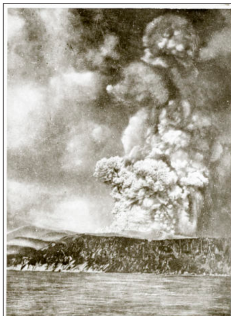
Figure 1. Picture of the eruption of the Krakatau, 27 August 1883. Collection Leiden University Library, KITLV 5888.

The disaster has received a lot of scholarly attention (Winchester 2003). Geologists, oceanologists, and volcanologists were fascinated and have written about what happened. Biologists, too, have been investigating the Krakatau. They have observed how flora and fauna have returned over time. Eyewitness accounts have also attracted great interest. Characteristic of the colonial context is the fact that Dutch authors predominantly wrote these texts. The same context explains that we only know the names of the European victims and survivors, whereas we are much less aware of how Indonesian people experienced the eruption.