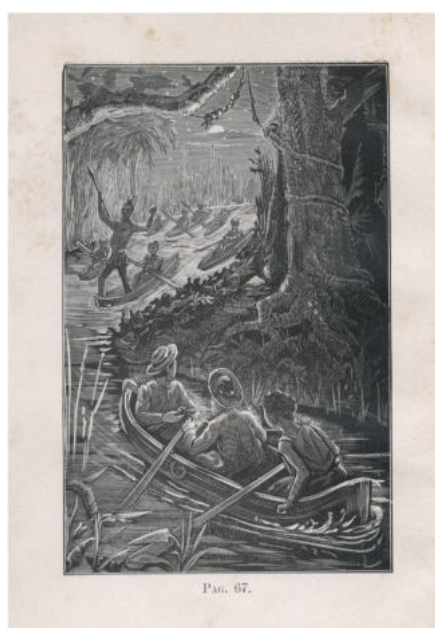
Figure 4. Willem, Van Berkel and Mozes are chased by "head hunters", image from Ballantyne, De kluizenaar van Rakata. Krakatau in vuur en vlam (1897). Collection University Library Leiden, 2856 F 27.

What can we conclude when we analyse The hermit of Rakata from a postcolonial perspective? It is striking that this work also contains several strategies that characterize the colonial discourse of those days. A vivid example is the fact that the author represents the Indies as a paradise, where the most delicious fruit hangs for the taking. At the same time, it is described as a dangerous place, full of bloodthirsty tigers, aggressive monkeys, and pirates. The descriptions of Willem's exciting journey contain a "narrative of high adventure" (Boehmer 2005, 60) that is typical for a lot of colonial texts written from a Western perspective.